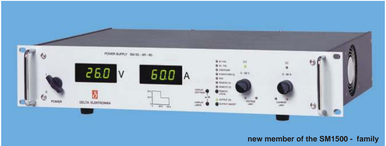
new member of the SM1500 - family